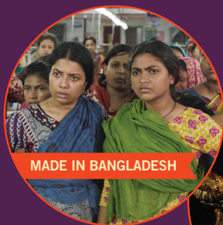
MADE IN BANGLADESH