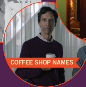
COFFEE SHOP NAMES