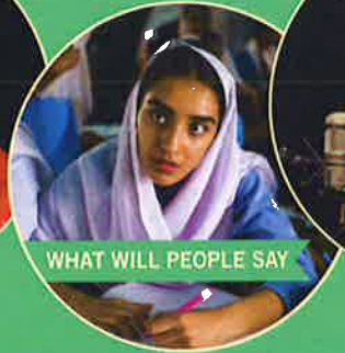
WHAT WILL PEOPLE SAY